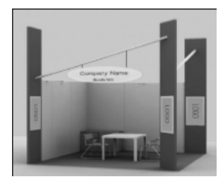
Model F (USD75/m<sup>2</sup>, min36m<sup>2</sup>)